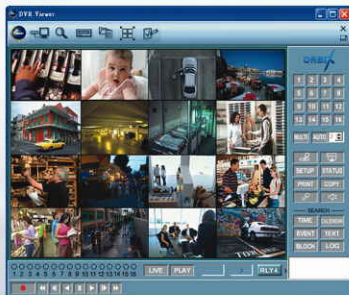
Orbix Software Client Interface

The advanced standalone H2648 series of security DVRs incorporate an embedded operating system with on-screen multilingual display (OSD) menu, audio and alarm inputs, user selectable composite or VGA video output, and stores video using the latest H264 compression code/decode (codec) format. It has a user selectable image capture rate and video resolution and can hold up to three internal disk drives (SATA interface). A built-in web server allows remote internet viewing using MS Internet Explorer 5.0 or greater. Free down-loadable software allows programming and advanced DVR control during remote viewing using the Orbix client interface.